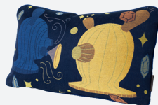
Jaime Hayon Cushion Blue