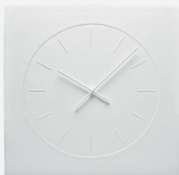
Wall Clock White paper