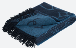
Jaime Hayon Throw Blue