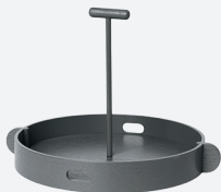
Tray Grey coloured ash

The novelties include line extensions of Objects classics and it introduces Japanese and Swedish design traditions to the collection, adding an exquisite and original expression to your home.