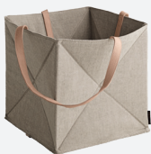
Origami Linen & Natural leather