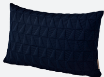
Arne Jacobsen Cushion Trapez, Midnight blue

The new Objects from Republic of Fritz Hansen™ are all about adding a graphic element to your interior and bringing a feeling of cosiness to your favourite relaxation spot.