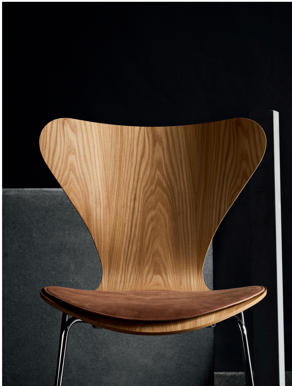
SEAT CUSHION BY FRITZ HANSEN