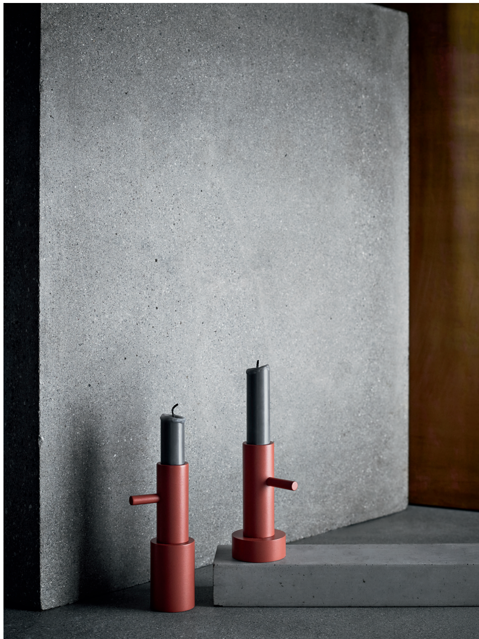
CANDLEHOLDERS BY JAIME HAYON