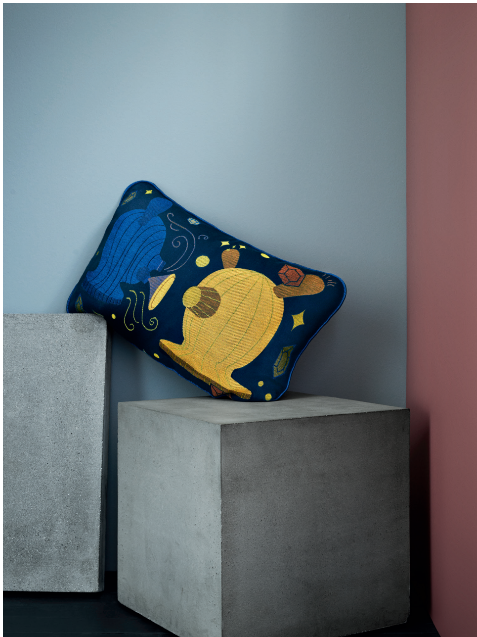
CUSHION BY JAIME HAYON