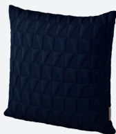
Arne Jacobsen Cushion Trapez, Midnight blue