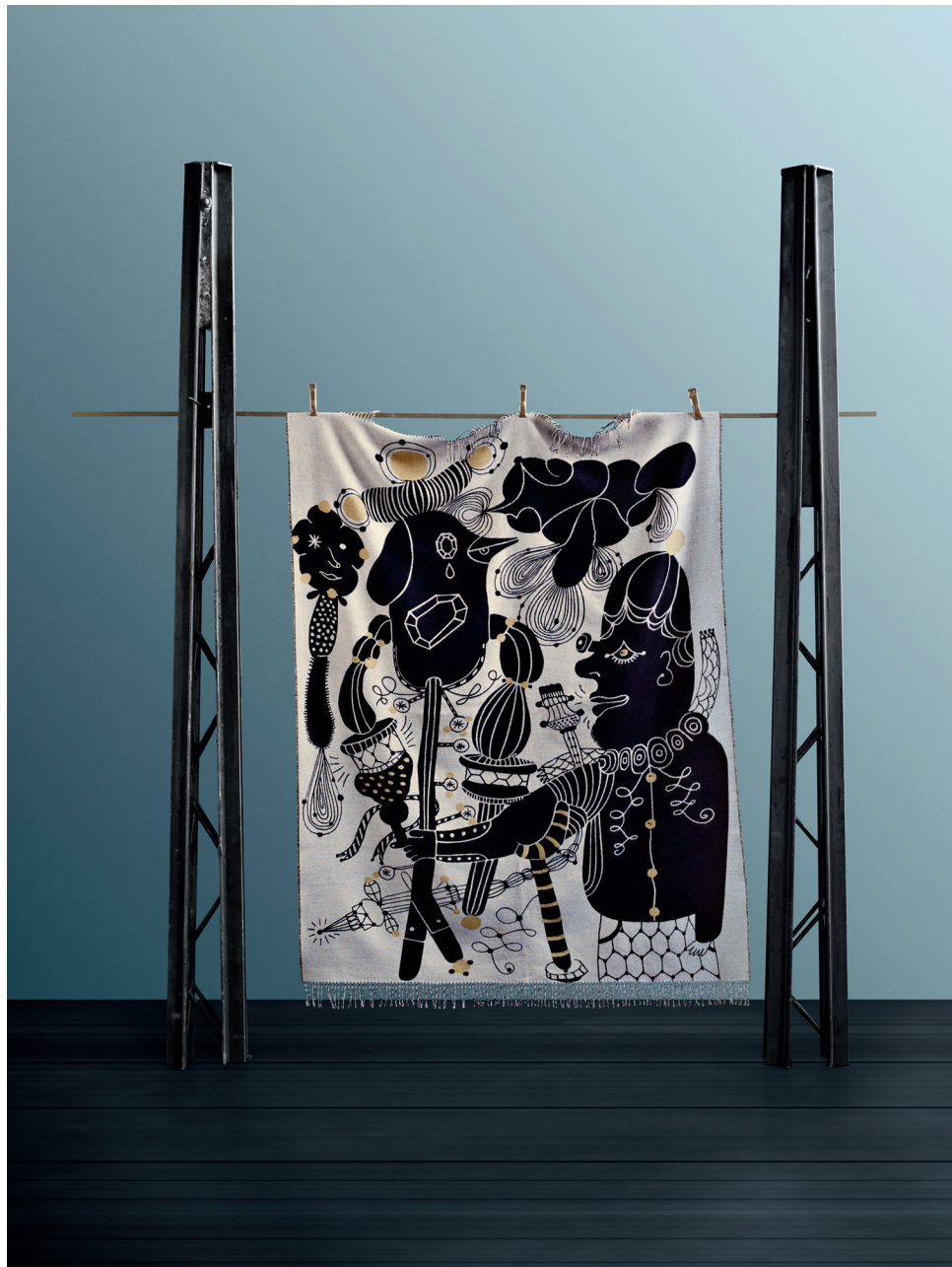
THROW BY JAIME HAYON