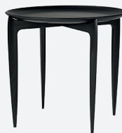
Foldable Tray Table Black lacquered