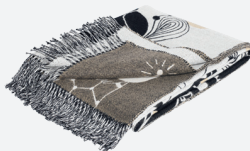
Jaime Hayon Throw Gold