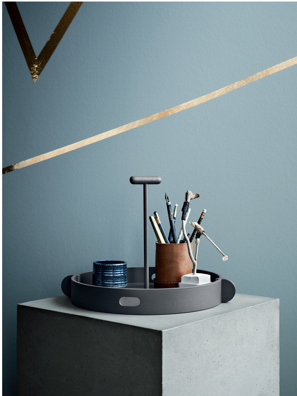
TRAY BY JAIME HAYON